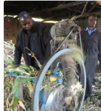
Maize cutting machine in operation