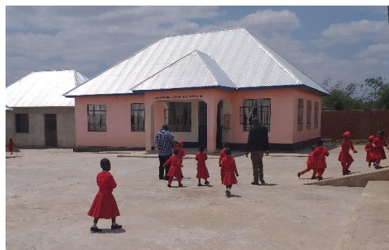
Students at one of the St. Dominic Savio Schools