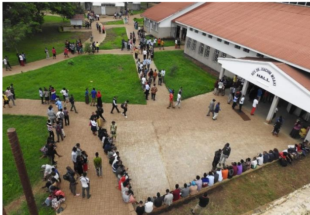
Students wait to attend a lecture at Mwenge Catholic University