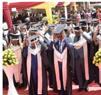
Students at graduation