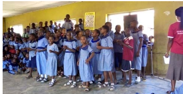
(Below) Students at a school run by the diocese