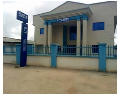
(Above) AMMIL Headquarters