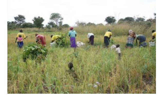
Women working at Odokibo farm harvesting rice