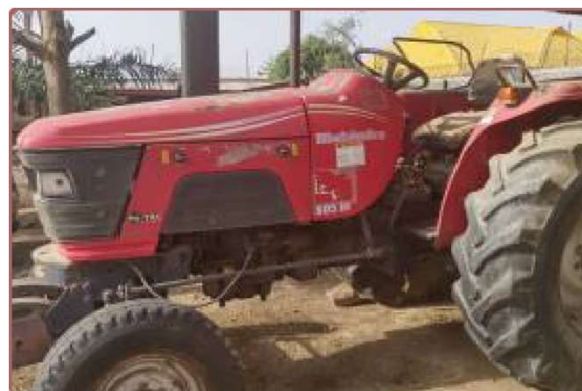
Tractor at Cathdiza Farm