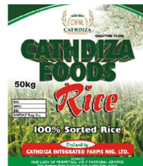
'Cathdiza Rice' package label