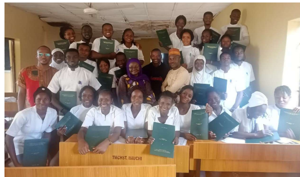
3 rd Year students with their completion certificates