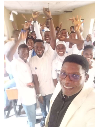
Project Leader with students after class