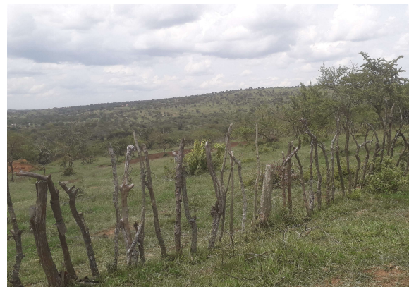
Pasture at the Sembabule Cooperative Society farm