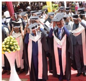
Students at graduation