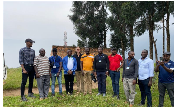
The Diocese development team with the project leader and the Pride Farms team