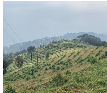
Terraces at Ruhengeri Farm