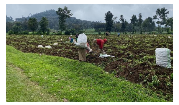
Women working in Busasamana Farm's potato fields