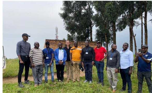
The Diocese development team with the project leader and the Pride Farms team