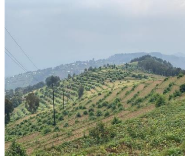
Terraces at Ruhengeri Farm