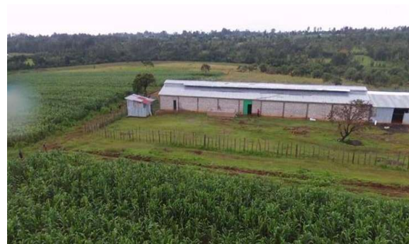
Debrety Farm Overview