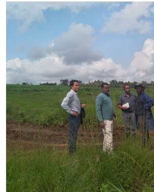
Missio Invest and Debrety Farm team meet at the farm