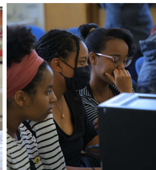
Three women learn in a temporary classroom